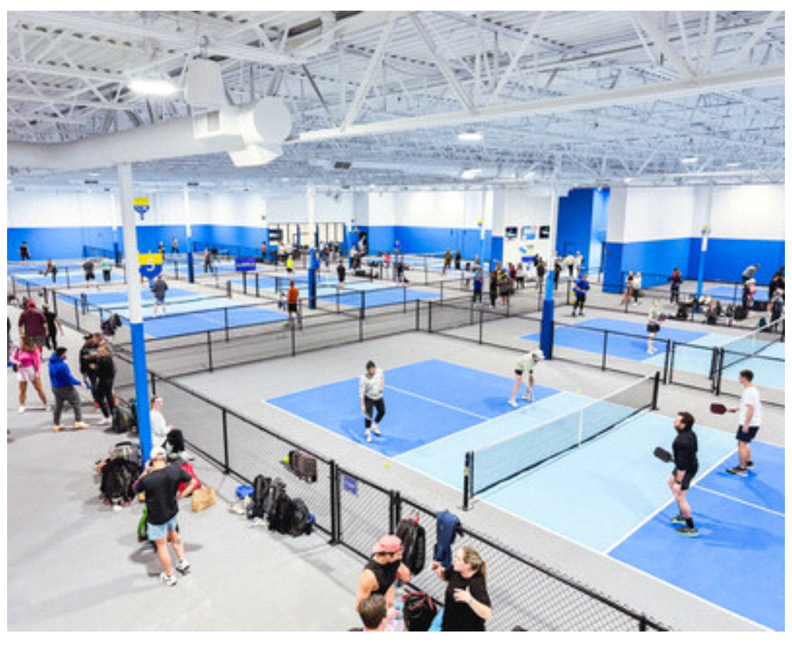
This is a Pickleball Kingdom in Nashville, Tennessee. Memphis is slated to have a similar lay-out. Memphis' state-of the art facility will span 42,300 square feet and feature 17 professional-grade indoor courts.

ganized for players seeking both casual and competitive play opportunities.